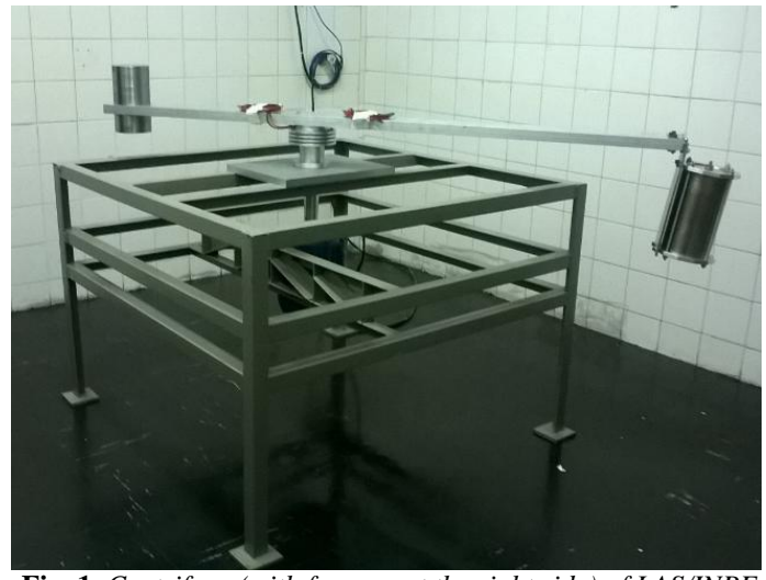
Fig. 1. Centrifuge (with furnace at the right side) of LAS/INPE.

The solidification experiments were carried out in a furnace attached to the centrifuge (Figure 1). A mass of 20g of the Pb_{38.1}Sn_{61.9} (wt%) eutectic alloy was prepared from 99.9999% purity elements and sealed under vacuum ( 5.10^{-6} Torr) in an 8 mm diameter and 100 mm length quartz ampoule (Figure 2). Solidification experiments were performed with both the furnace standing at 1g and rotating at 6g with the same thermal parameters, where g is the gravity acceleration on earth (9.81 m/s<sup>2</sup>). In the second experiment, after heating the furnace up to a temperature of 200°C for 1 hour, the temperature controller was disconnected and the motor turned on at 92 rpm and kept running at constant speed during the whole solidification process.