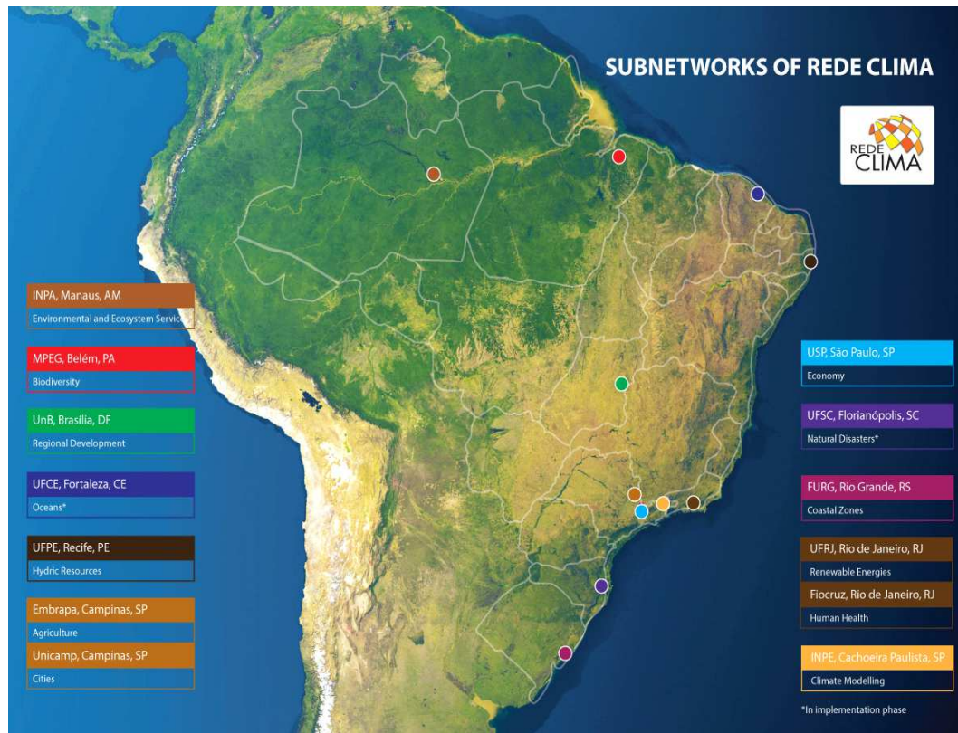
Figure 2: Sub-networks of Rede CLIMA. The headquarters of the sub-networks are based in each of Brazil's five regions. Each sub-network is a network in itself, with links connecting the headquarters to other Brazilian and foreign institutions, so that, in practice, Rede CLIMA's reach and interconnectedness are much greater than what can be perceived here.