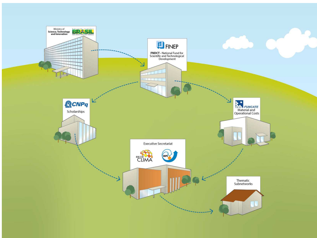
Figure 3 – Financial Resources paths from the origin within the Federal Government to the Sub-Networks of Rede CLIMA.

The development of the Brazilian Earth System Model (BESM) is the central pillar to achieve the goals of Rede Clima. Eventually, BESM will have counterparts of all sub-networks, at the same time that it will generate climate change scenarios for all the Network expert activities.