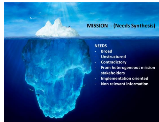
Figure 1. User needs synthesis

Figure 1 represents graphically what implies to synthesize those user needs taking in consideration aspects that constraints the needs in the analysis like the programmatic requirements and the technical feasibility. In some cases, the term "needs" as an input on the systems engineering literature, can be misinterpreted with just the top of the iceberg.