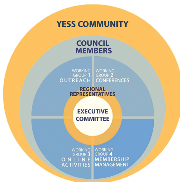
Fig. 2. The structure of the YESS community.

We envisage the establishment of a truly global and interdisciplinary Young Earth System Scientists community to organize and enhance interactions among early-career researchers around the world (Rauser et al. 2015). This community will connect with existing networking efforts not only from within WCRP, WWRP, and GAW, but also with other global Earth system science–related research initiatives, such as Future Earth. We believe a sustainable organizational structure will allow the next generation of Earth system science leaders to work in an integrative and collaborative way to effectively tackle the challenges of Earth system science without the disciplinary boundaries of the past—and to push our science beyond the frontiers outlined in this essay on the way. We believe that increased awareness of funding agencies around the world is required to support an early-career researcher network in Earth system science (see Fig. 2). The network we suggest specifically has been developed from the bottom up, is interdisciplinary in nature, and aims to become well