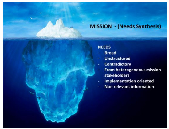
Figure 1. User needs synthesis

Figure 1 represents graphically what implies to synthetize those user needs taking in consideration aspects that constraints the needs in the analysis like the programmatic requirements and the technical feasibility. In some cases, the term "needs" as an input on the systems engineering literature, can be misinterpreted with just the top of the iceberg.